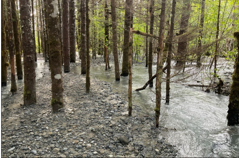
Figure 2.–Fresh sediment and braids in the forest at waypoint 670.