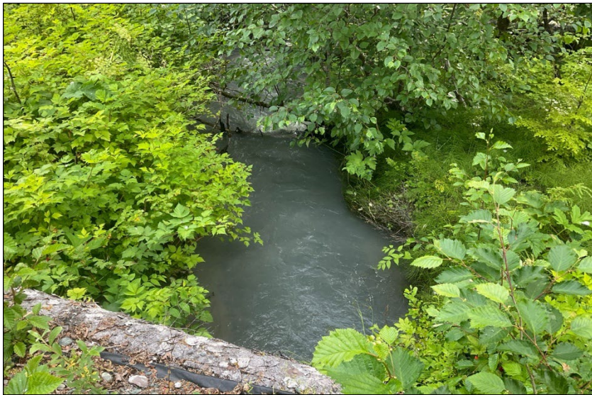
Figure 3.–Stream going under log stringer bridge at waypoint 666.