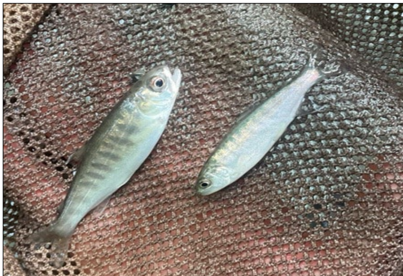
Figure 1.–Juvenile coho salmon caught at waypoint 1101.